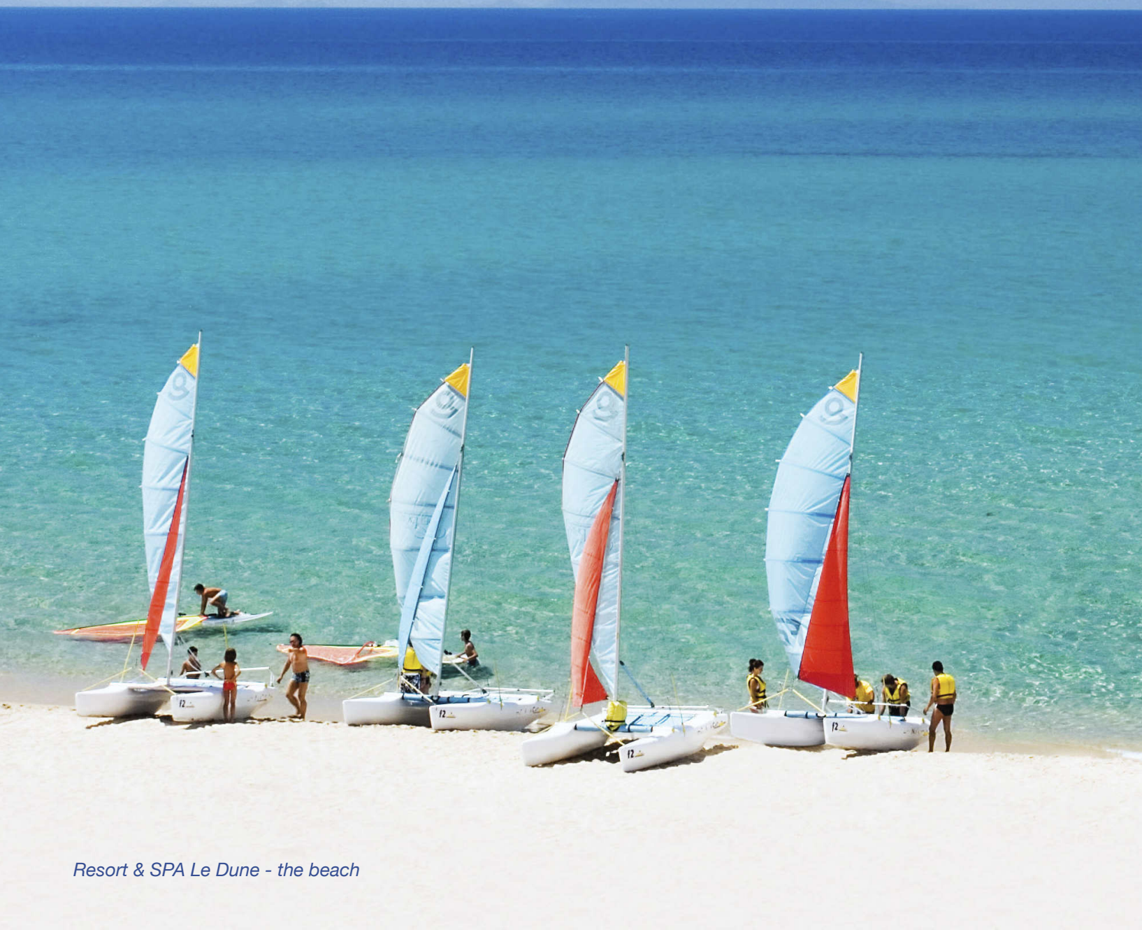
Resort & SPA Le Dune - the beach